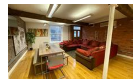
The Margolis Building, Turner Street, Manchester £48,000 pa