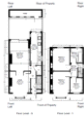
10. Block Plan 101 100